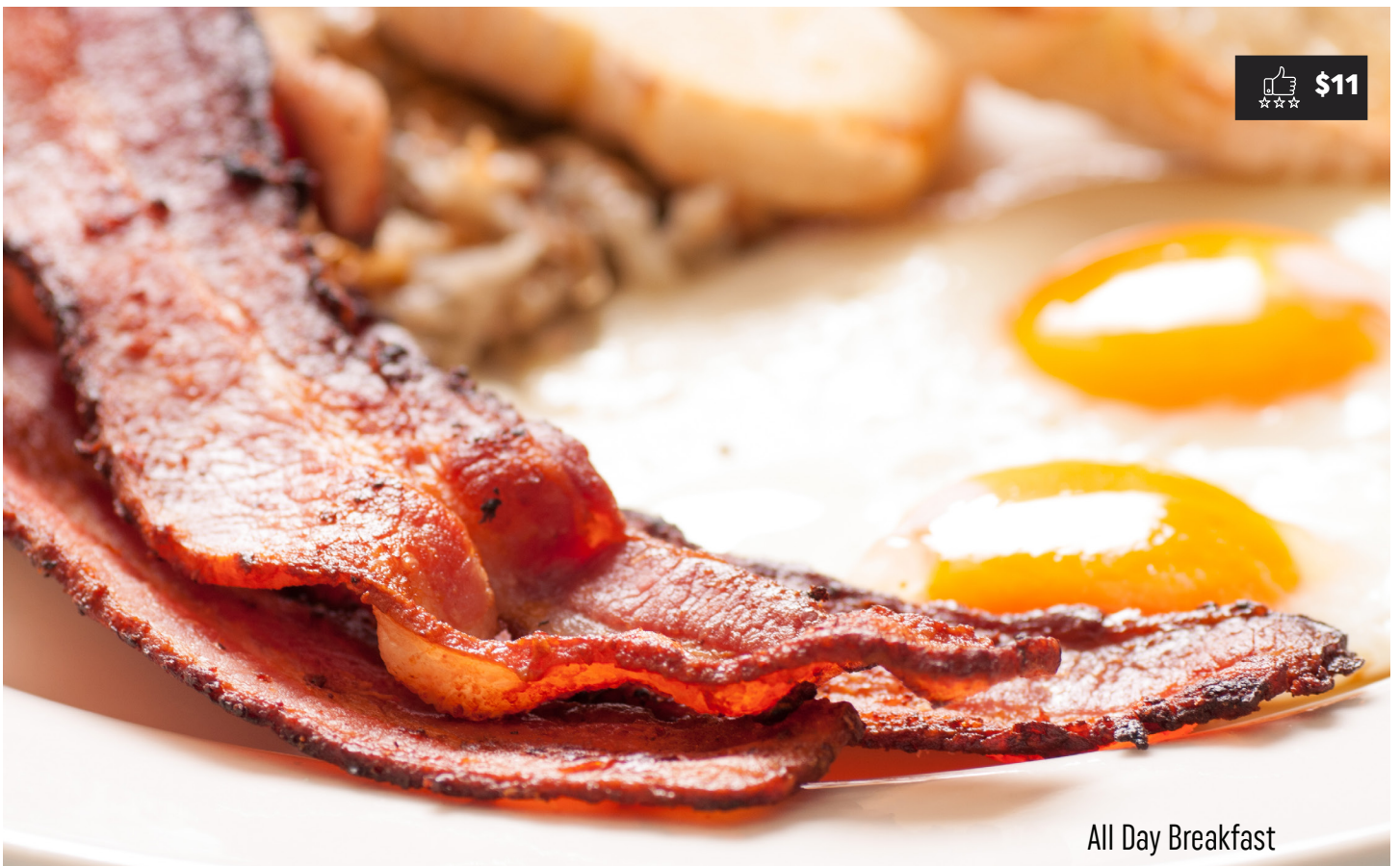
All Day Breakfast